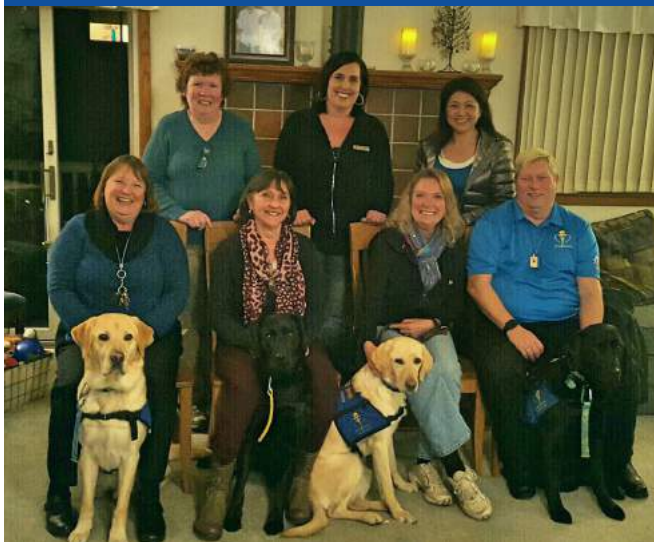
Our first Albany Foster Care Group Meeting!

If you have thought about fostering for us, or know someone who is interested, NOW is the time to get started. Our ten week new foster training classes will begin on Thursday, February 11 th at 6:30pm at the D4D Training Center in Concord. Come Join Us. Foster a Dog, Save a Life!